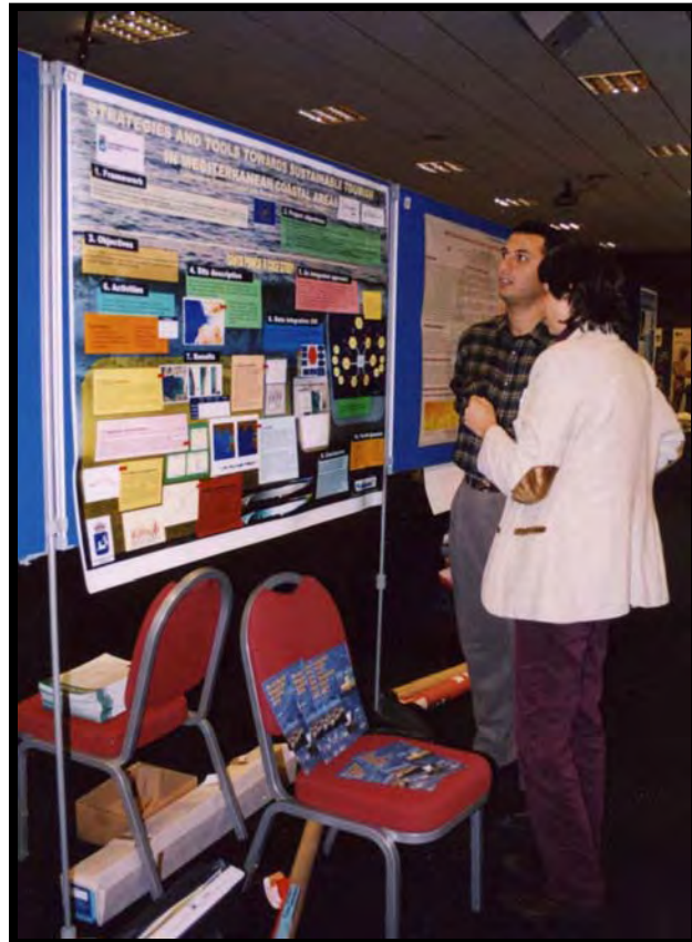
A CoPraNet partner exchanging ideas with an attendant at Littoral 2004.

Sefton Metropolitan Borough Council, is responsible for coordinating the erosion theme. Currently CoPraNet is aiming to get an overview, within the geographical areas that the CoPraNet partners cover, of coastlines affected by erosion. Depending on the results questions such as; what kind of