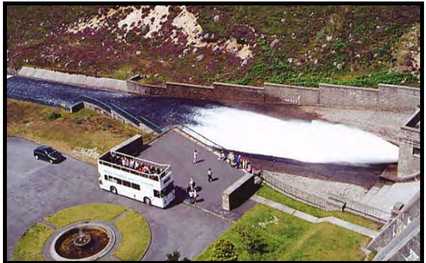
Reservoir in Silent Valley, Northern Ireland.

Ireland. Another positive aspect of involving local politicians is that it will assist to facilitate a greater involvement in European projects and further highlight the benefits to be achieved from networks such as CoPraNet."