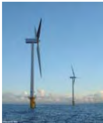
Existing offshore wind turbines at Blyth