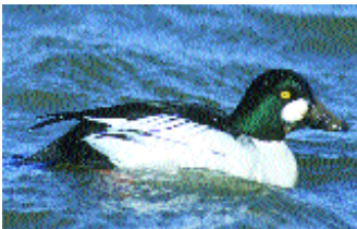
Top. Snow Bunting Bottom. Goldeneye male