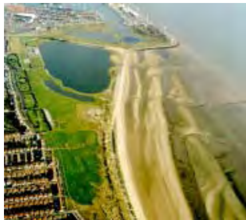
Crosby Coastal Park looking South, Bootle Docks

Crosby Marine Park was included in the Atlantic Gateway "Strategic Investment Area" 3 and funding was secured for a feasibility study to develop a project for funding through the Merseyside Objective 1 Programme.