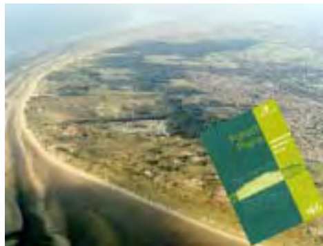
Sefton Coast Forest Woodland.