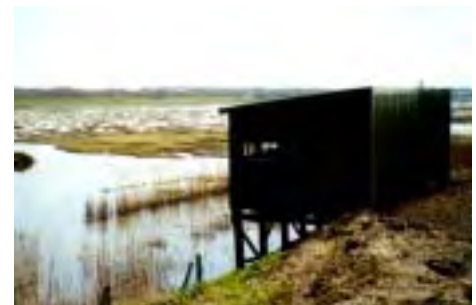
Nel's Hide at RSPB Marshside