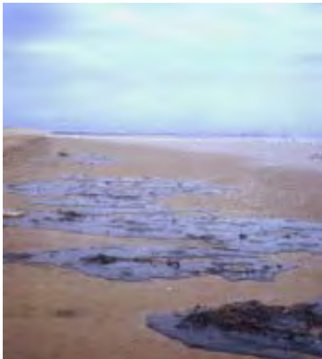
Oil spill on a Sefton Beach