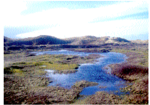
High water level in Ravenmeols LNR

Nearly ten years after the implementation of the Beach Management Plan the Coast and Countryside Service can now claim to be the only fully integrated service in the country following the inclusion of the cleansing operation in 2001. The Service now comprises the Coast and Countryside Ranger Service and Voluntary Rangers, Beach Patrol and Lifeguard Unit, Estate Team/Environment Task Force and Beach Cleansing.