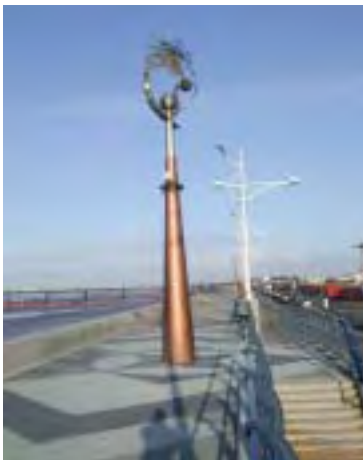
Southport Seawall - Phase 1