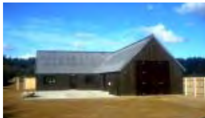
Countryside Office and Workbase at Blundell Avenue